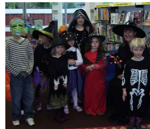
Spooky Halloween Storytime.

We also had a spooky Halloween Storytime on 30th November with spooky stories and songs. We hope all that came had a great time! There were some fantastic costumes, including some witches, a skeleton and a monster! Thanks again to all that took part.