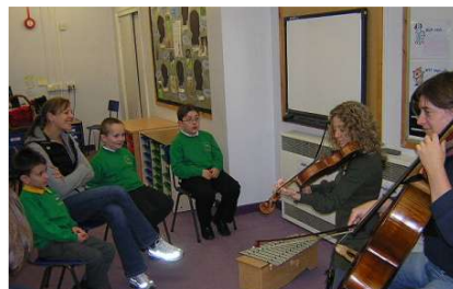
Pupils working with musicians from BBC Philharmonic.

THE HIGHLIGHT OF the autumn term was a performance of the 'Rosebank Train Ride'. This was the culmination of a series of visits by 4 musicians from the BBC Philharmonic Orchestra who helped our pupils to compose and play their own unique pieces of music.