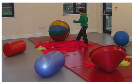
New room for Physiotherapy, Occupational Therapy and relaxation activities.

The concert was timed to celebrate the completion of a new extension to the school which provides a Music Therapy room and a large space for Physiotherapy, Occupational Therapy and relaxation activities.