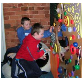
The pictures show two of our boys enjoying some activities in the Sensory Room and a class group helping to plant primulas, both on the residential visit to CAFT.

All the pupils in KS2 at Rosebank School have thoroughly enjoyed the residential visit to the Children's Adventure Farm Trust in Millington. A host of different experiences was available to them - feeding the animals, playing on the adventure playground, games in the sports hall, and activities in the art room. The Farm also has some wonderful resources for young people with additional needs, including multi-sensory room, ICT suite, music room and mini-cinema. We had a great time.