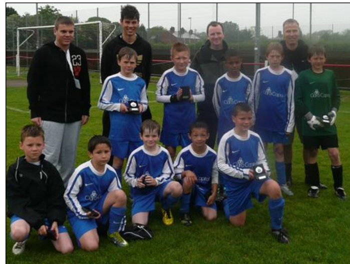
Barnton Wanderers Youth FC under 10's narrowly lost to Middlewich Town 1-0 in the final of the under 10's Mid Cheshire Albert Steele Cup at Middlewich, they had most of the possession and chances but couldn't force the win.