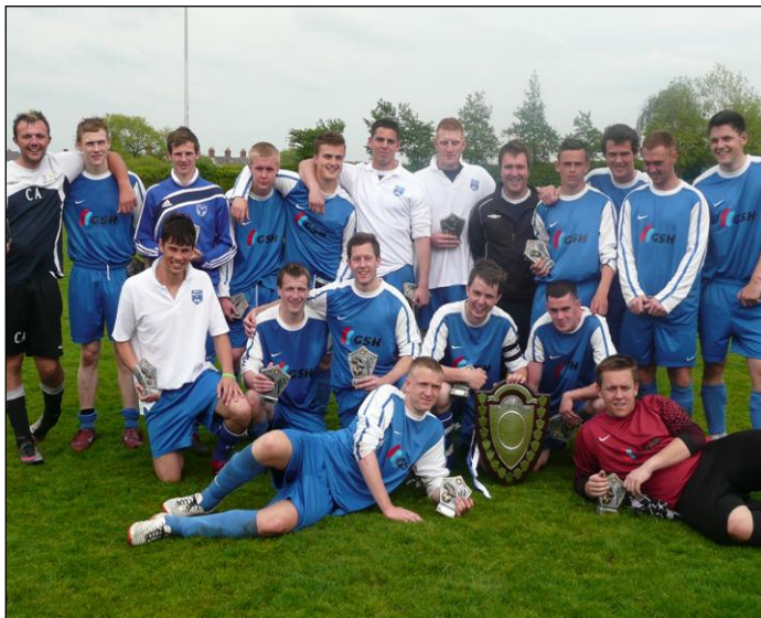
Barnton Wanderers FC, in their first year won the Crewe & District Shield, beating Tarporley Victoria 2-1 after extra time at Crewe FC.